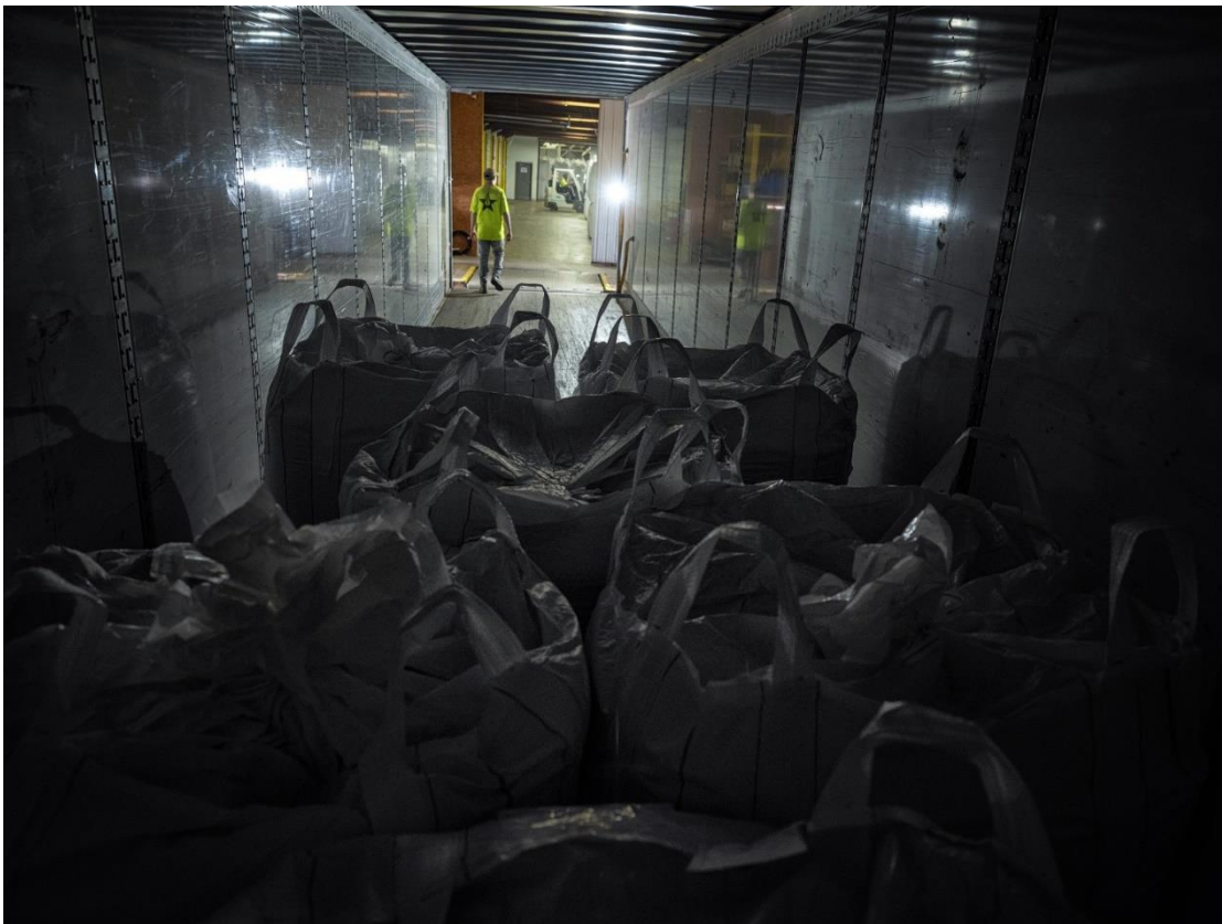
Trailers are loaded with dry beans to ship.

We've Got an Itch for Oats – In preparing for the future, Star of the West looked to the past to bring an old crop back to life. We are partnering with several food customers to help oats make a resurgence in Michigan. We also partnered with Michigan State University to put out three oat trials with 42 varieties. Oats are an awesome soil health builder, a perfect addition to crop rotation in Michigan, and will be a great raw ingredient for our ready-to-eat flaking business.