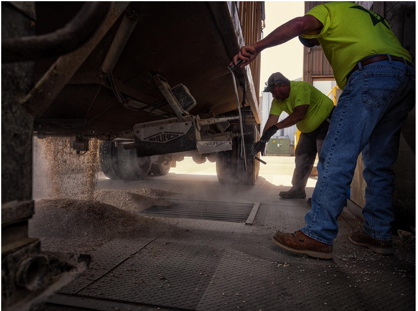
Beans are unloaded at the Reese, Michigan facility.

One example in 2021 of improving customer satisfaction with products that meet or exceed customer expectations was the addition of our flaking facility at the Frankenmuth location. We worked closely with a current customer and found they had a need for flaked wheat and they also wanted to source it closer to their production facility in Michigan. We were able to construct a facility and now supply this Michigan-based production facility with wheat grown and flaked in Michigan. This helped the customer and the environment both; instead of paying for freight from the western U.S., the customer only pays freight from Michigan. Along with the freight savings is the carbon reduction associated with fewer miles of transportation.